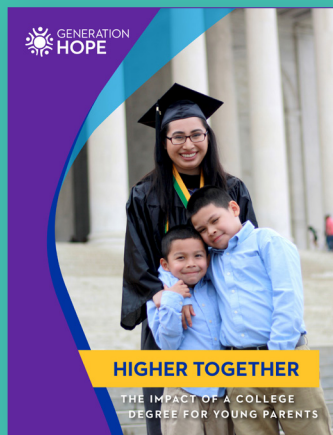
Higher Together: The Impact of a College Degree for Young Parents